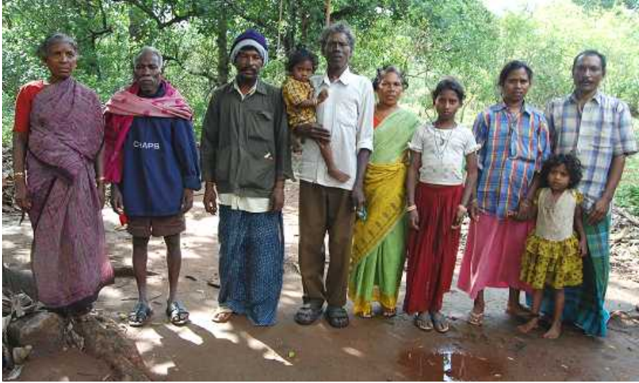
Some of the affected tribe families