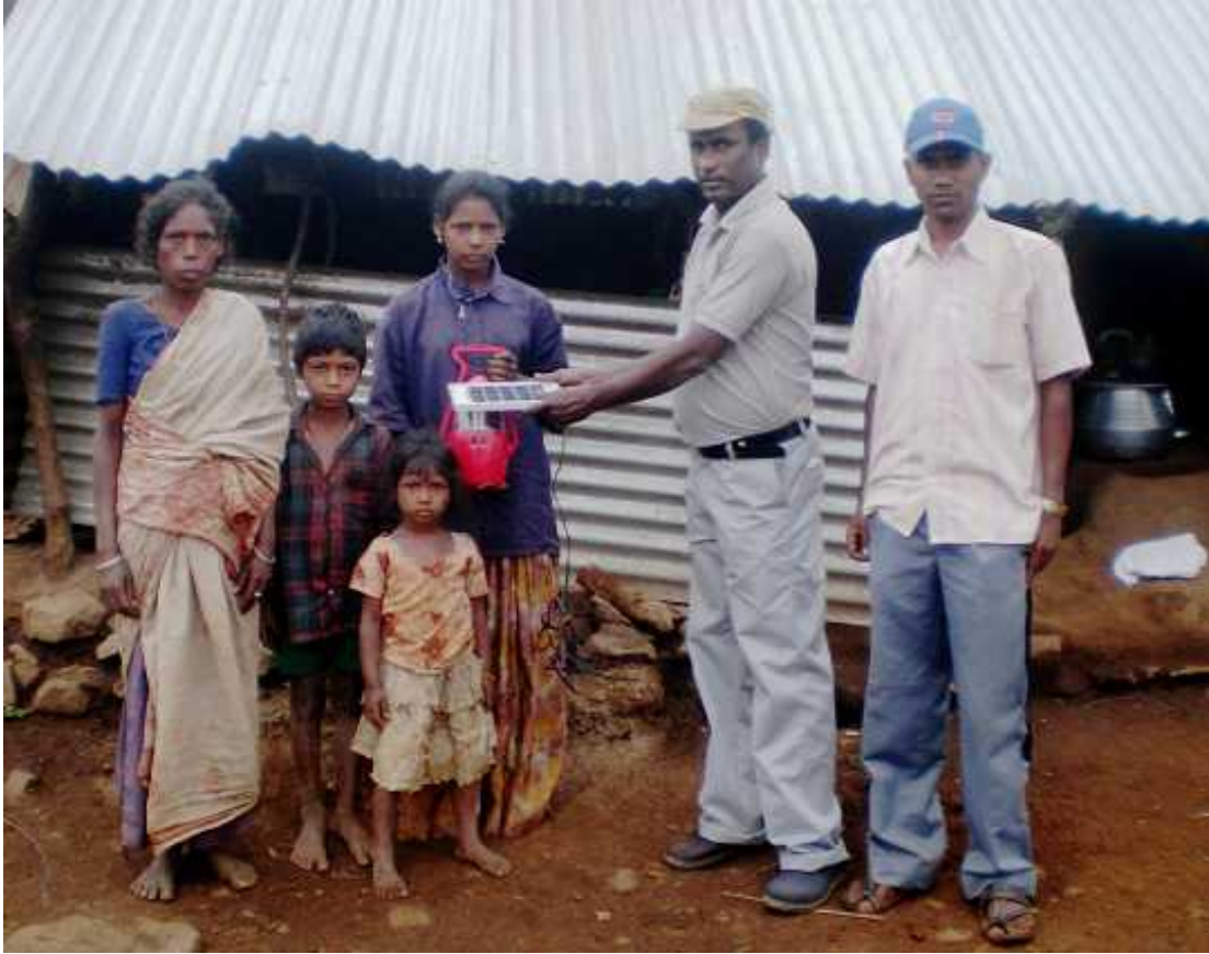
Solar light support to tribes