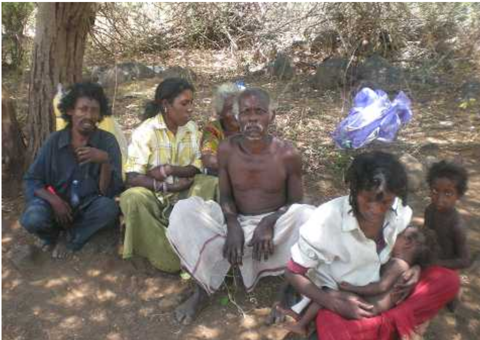
Just retrieved tribe families from Caves and to be rehabilitated by ROSI FOUNDATION