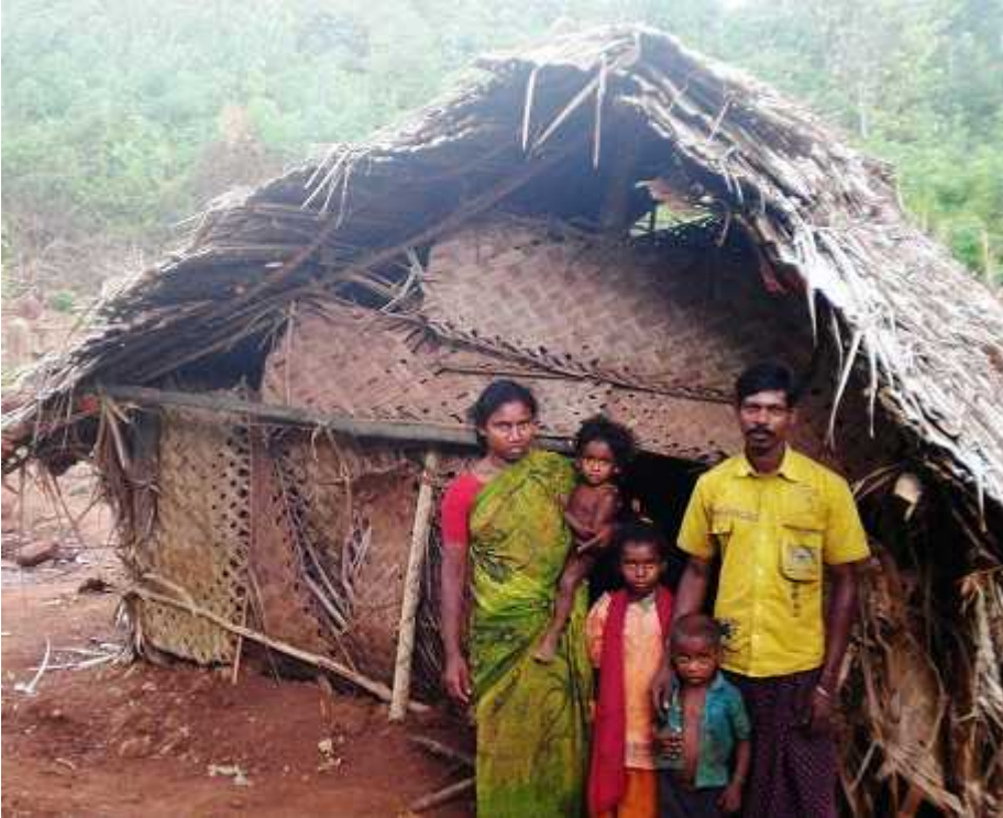
The one retrieved family is provided by a temporary house in the above land