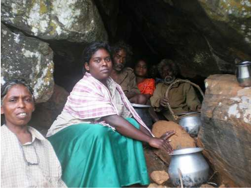
Still in to cave