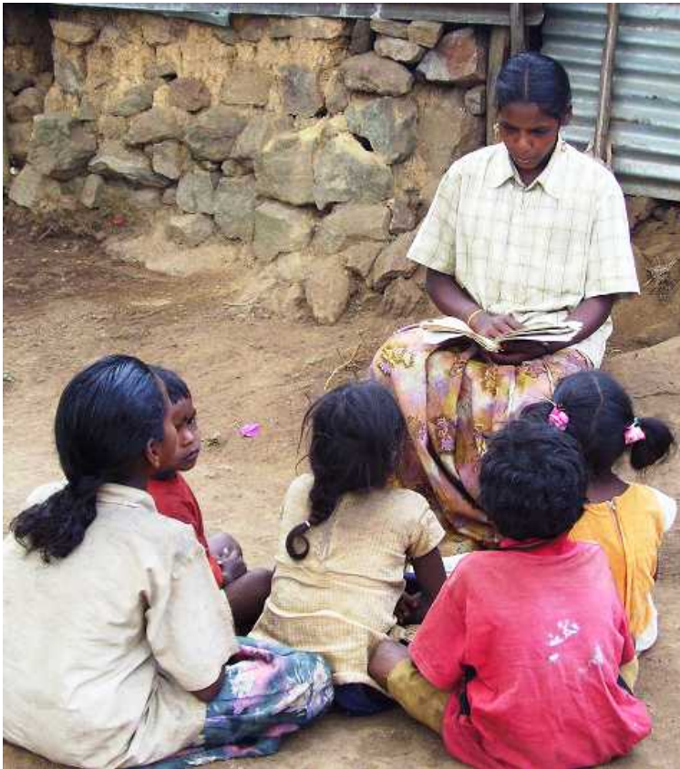
Tribe children under non-formal education by ROSI Foundation