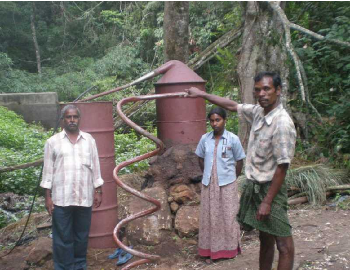
Another one IGP unit functioning in production