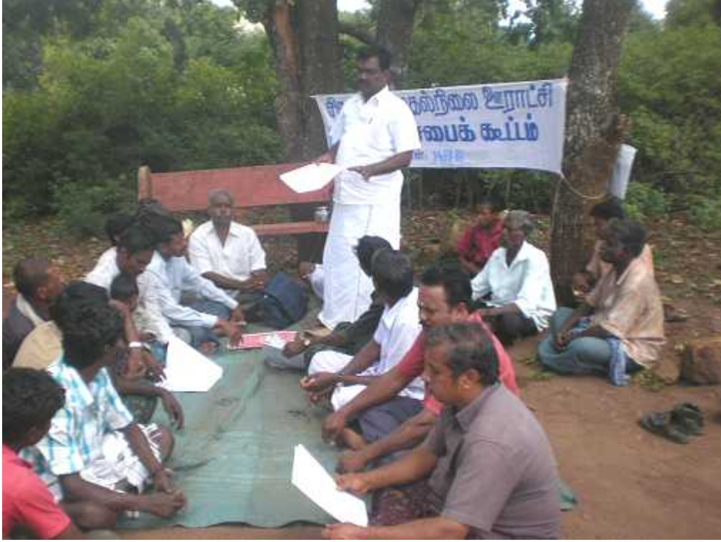
ROSI's representative fights for tribe in Local Body – village committee meeting