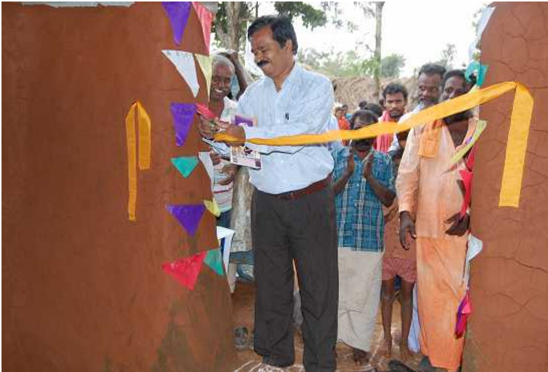
ROSI's educational centre opening to tribe children