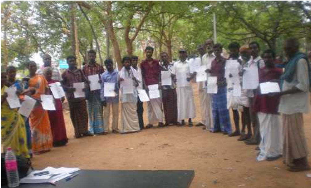
ROSI Foundation takes Some tribes with petition seeking house patta and community certificate to dist collector