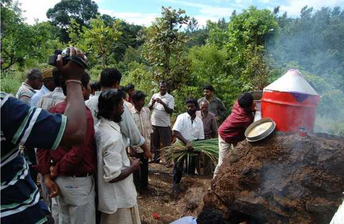
IGP unit opening (Lemon grass essence extraction) to tribe families by ROSI Foundation