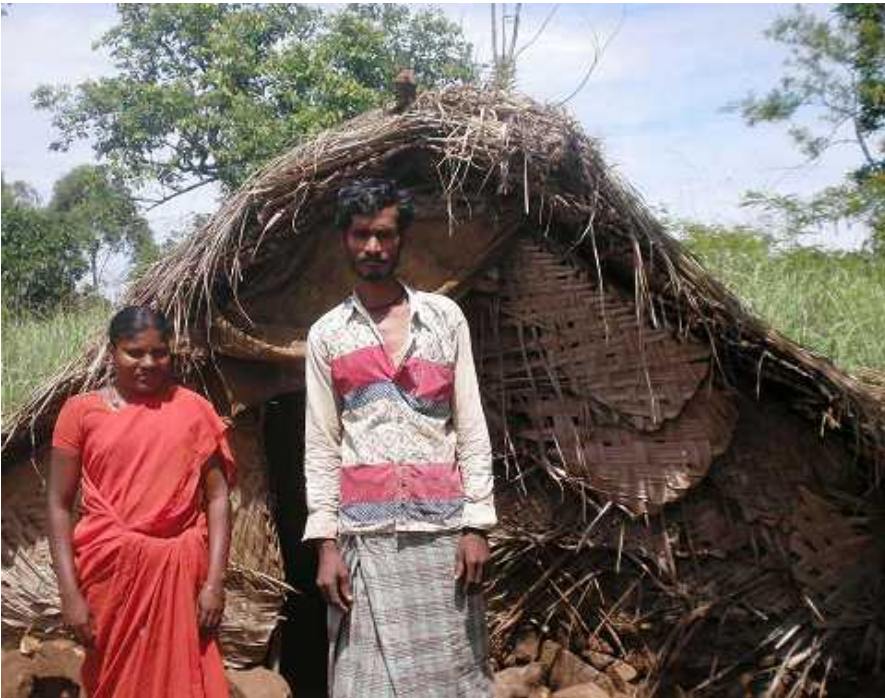
The another one retrieved family is provided by a temporary house in the above land