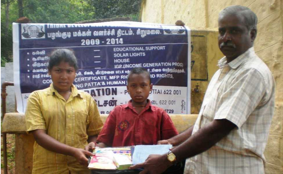
Educational materials and uniform distribution to tribe children