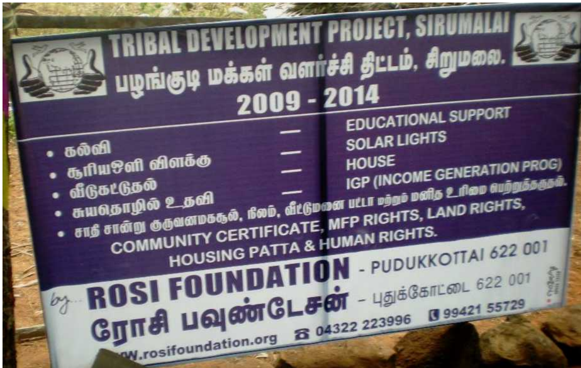
A BANNER/BOARD DETAILING THE ROSI PROJECT FOR TRIBE PEOPLE