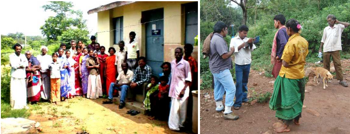
ROSI's Fact Finding team with the affected tribe